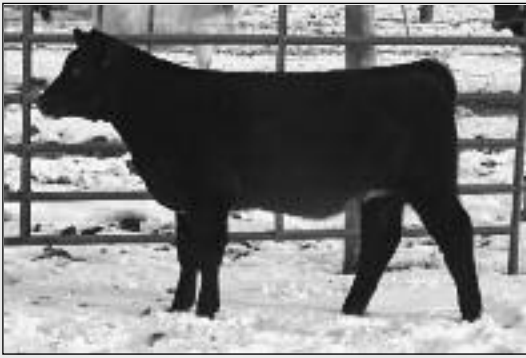
Lot 37 - B Good Lady