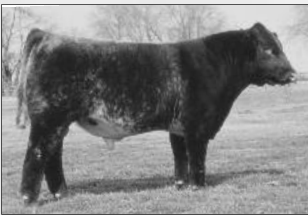
WHR Sonny 8114

Selling 3/4 interest and full possession; retaining 1/4 in-herd semen interest only. 2009 Kentucky State Fair Grand Champion Shorthorn Bull. Hawk is big boned, extremely wide, deep bodied, has a straight top, clean and long necked. Gentle disposition should make him an excellent herd sire.