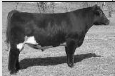
CF Solution X

Guarantee one pregnancy if implanted by a certified technician.