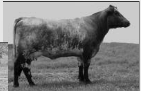
RT Lucky Charm 59J