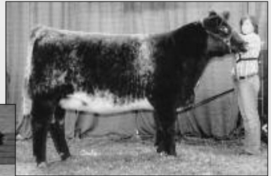
WL Augusta Pride 132