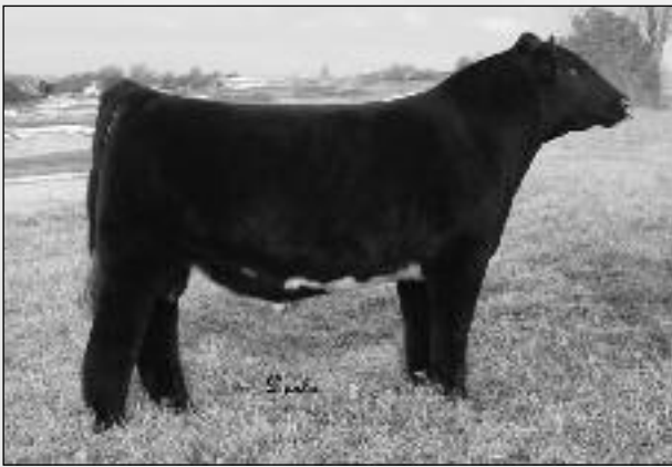
SULL GNCC Final Solution