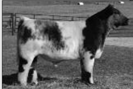
CF Primo X

Guarantee one pregnancy if implanted by a certified technician. We are excited about this mating. The Augusta Pride cow family and the Primo genetics. Just look at her calf in the stalls and you will see why we are excited.