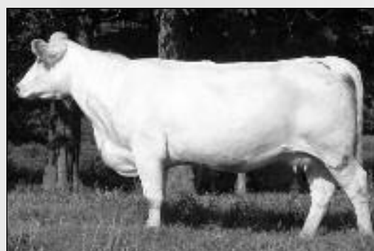
MCC RFS Roan's Sue DV111S

Here is a really nice heifer that has a pedigree that is second to none. This heifer will have plenty of size to go along with her depth of body and sound structure. She will be fun to show for two years and then she will make a valuable addition to your cow herd. This one should be staying here, but as neither one of our families are showing in the junior shows anymore, we decided to let someone else have all the fun. We didn't get a good picture due to the weather, so we are showing you what her dam looks like instead. Sire and dam are tested TH/PHA Free.